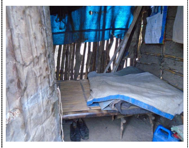
Fig 3. Shelter without beddings/Host family MW