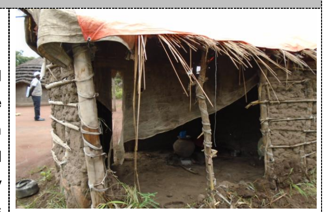
Fig 1. Destroyed occupied shelter

The community reported that their principal source of livelihoods is agriculture. 60% of the affected population earn their livelihoods through agriculture. The remaining portion of the affected population (40%) earn their livelihoods mainly from Fishery and other businesses. But all tools for agriculture were looted. The host community is sharing the little food they have with the IDPs.