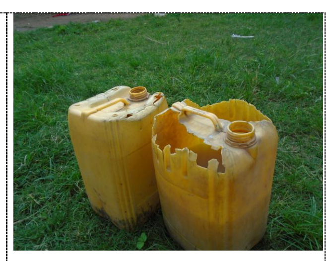
Fig 5. Old jerry cans that are still being in use.