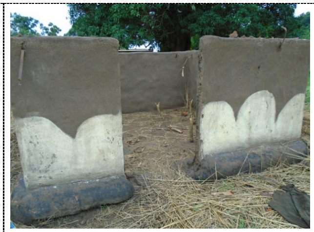
Fig 2. Shelter destructed due to crisis

The IDPs, as well as Host families need Blankets, Plastic sheetings, sleeping mats, jerry cans, soaps, mosquito nets, etc. The few shops which were not looted are those selling hardware and NFIs; and their prices have hiked enormously, due to fluctuation of USD against